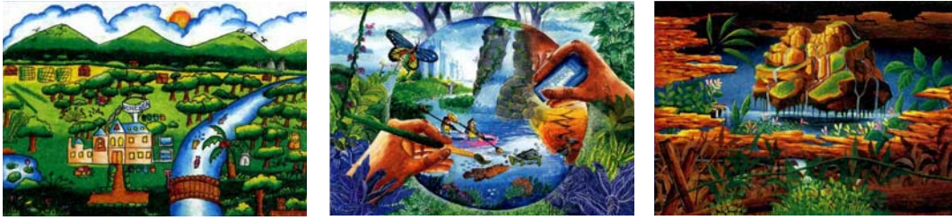
Environmental painting awards